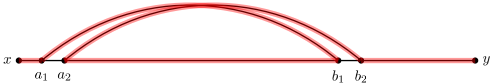
Figure 2: Shortening of the path P using the crossing edges a_1b_1 and a_2b_2 . The resulting path is P' and is drawn in red.